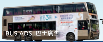
BUS ADS. 巴士廣告

Local Transit Reach: metro advertisements, bus body and selected outdoor ads, ensuring continuous visibility of the exhibition.