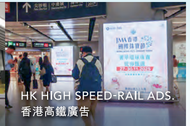
HK HIGH SPEED-RAIL ADS. 香港高鐵廣告

Strategic Cross-Border Presence: capturing premium China buyers with Strategic ad placement inbound and outbound to deliver exhibition messages directly.