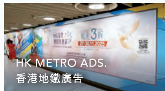
HK METRO ADS. 香港地鐵廣告

本地交通滲透：透過港鐵站內廣告、流動巴士車身廣告以及精選地段戶外廣告，讓展會形象持續穿梭於城市脈絡。