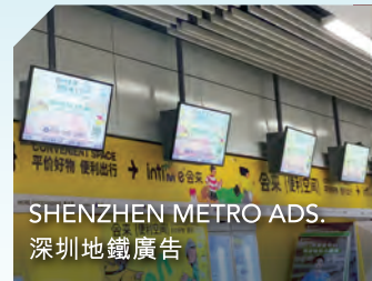
SHENZHEN METRO ADS. 深圳地鐵廣告